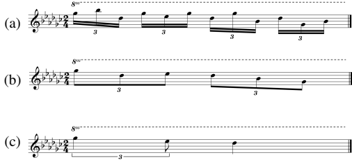
Figure 4. (a) The right-hand part of the first bar of Chopin's Étude , Op. 10, No. 5. (b) A plausible rhythmic reduction of (a). (c) A plausible rhythmic reduction of (b).

this particular case, the mask \langle 4, \langle 2, 2, 3 \rangle can be used to represent a dominant triad in a seven-note scale. Applying this to the output of the mask \langle 3, \langle 2, 2, 1, 2, 2, 2, 1 \rangle therefore gives a representation of the dominant triad in E^b major—i.e., the B^b major triad. If the topmost number line in Figure 3 represents MIDI note number, then MIDI pitch 10 maps onto 4 in the middle number line, representing the fact that 10 is the fifth scale degree in E^b major. The number 4 in the middle line is then mapped onto 0 in the lowest number line, representing the fact that this scale degree is now the root of the dominant triad. Thus, the dominant triad in E^b major can be represented by the mask sequence, \langle\langle 3, \langle 2, 2, 1, 2, 2, 2, 1 \rangle\rangle, \langle 4, \langle 2, 2, 3 \rangle\rangle . This example demonstrates that a mask sequence can be used to represent the notion of hierarchically related pitch alphabets proposed by Deutsch and Feroe [1]. For example, the mask sequence \langle\langle 3, \langle 2, 2, 1, 2, 2, 2, 1 \rangle\rangle, \langle 4, \langle 2, 2, 3 \rangle\rangle corresponds to Deutsch and Feroe's alphabet,